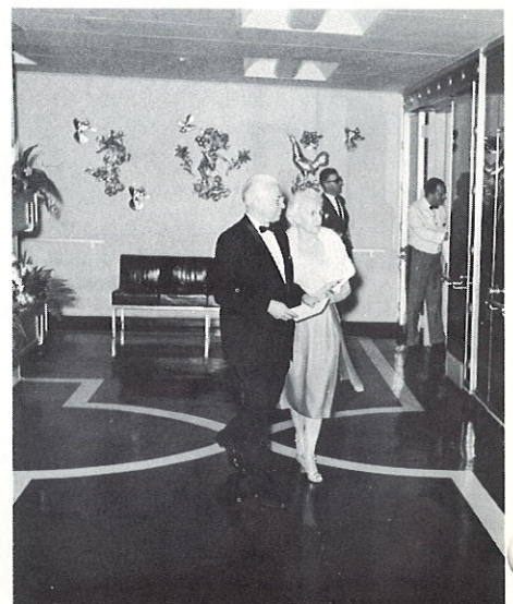
The beauty of a very fine and modern ship.